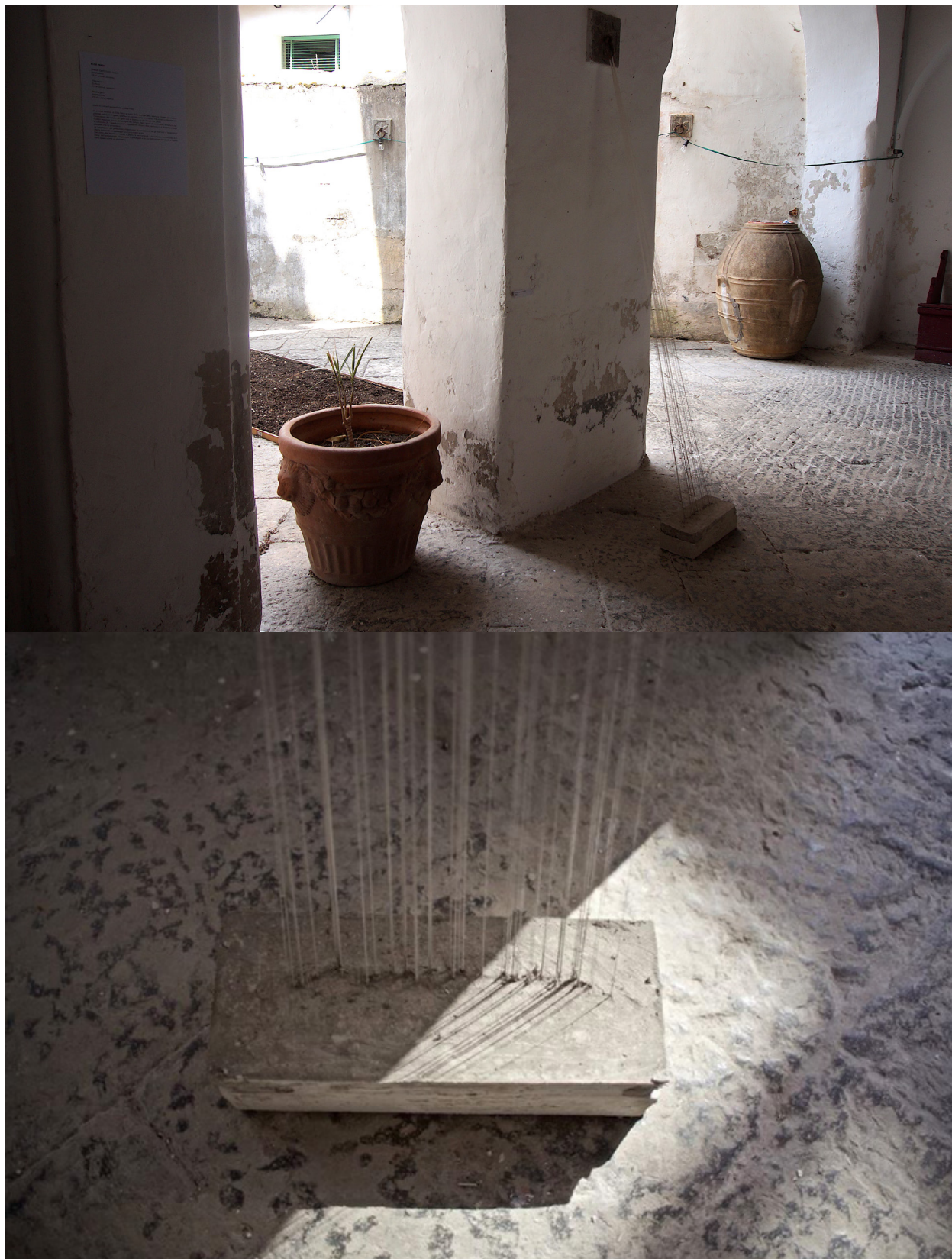
EARTH'S BREATH ephemeral installation cotton, cement 2015