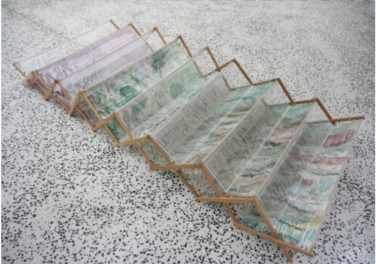
PAYSAGE MARBRÉ Reversible weaving Silk painting, linen, steel 83 x 200 cm 2016