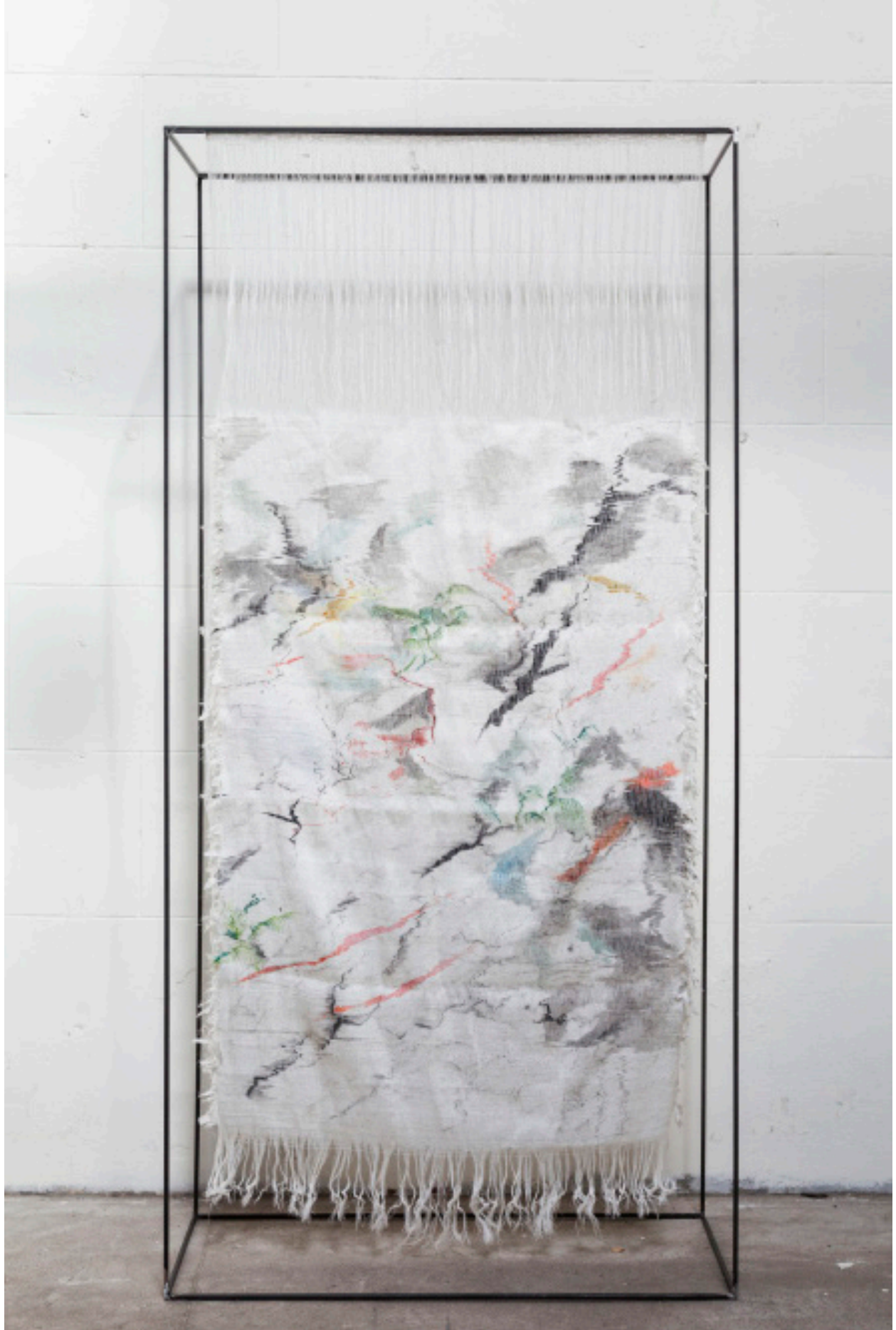
PAYSAGE FRAGMENT Reversible weaving Silk painting, linen, steel 200x88x43 cm 2017