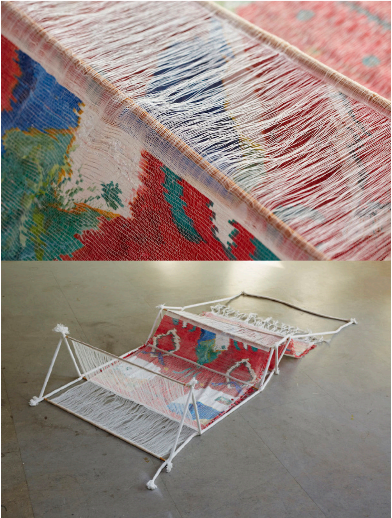
ARBRE DE VIE Reversible weaving Silk painting, linen 200/91/29 cm 2017